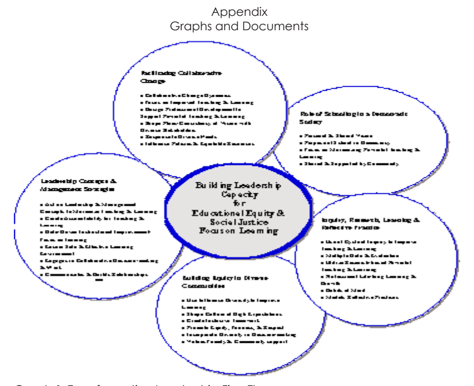
Graph 1. Transformative Leadership Five Themes